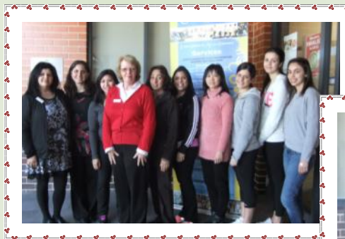
Pictured Above: The Kingsgrove Out Of School Hours Care Team.

Congratulations to the Kingsgrove OOSH and Hurstville OOSH Services for making it as Finalists for the most outstanding Childcare Service in the St George Local Business Awards. Well deserved for all your hard work. There were 10 other finalists in this category and we had some good competition. Great job for getting this far.