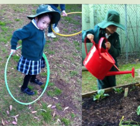
We enjoy the mini Olympics on Tuesdays! We CAN hula hoop on our own.