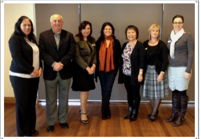
Pictured Top: The very happy parents who attained their First Aid Certificates.