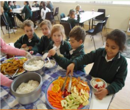
Yes! We are in kindy and year one and we CAN serve ourselves!

Children who attend our OOSH service on Wednesday's will be invited to go on an excursion to the Cricket Gala Day at Jubilee Oval in Kogarah. This event is organised with Active Sport Australia on Wednesday 28 th August, 2012. Children will have the opportunity to meet other children from the local area to participate in a cricket sports clinic.