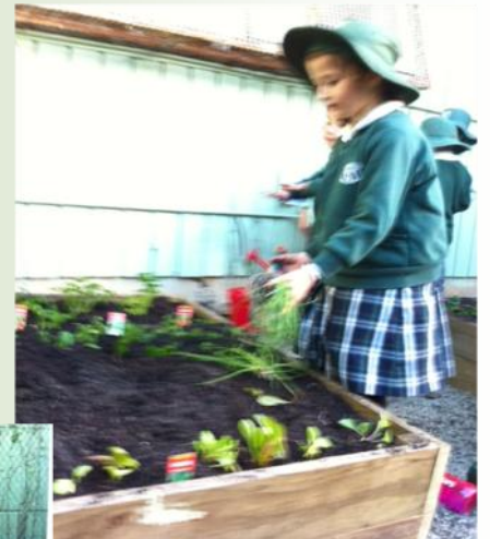
We love our new garden! We CAN look after it on our own.