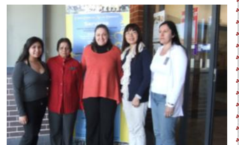
Pictured Right: The Hurstville Out Of School Hours Care Team.