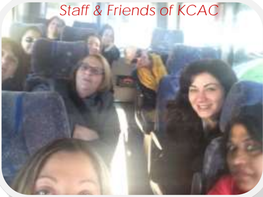
Staff & Friends of KCAC

On Saturday the 27th of June, the staff and friends of KCAC went on a trip to the Hunter Valley for a fun day out & bonding exercise.