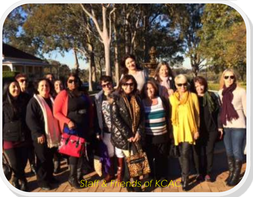
Staff & Friends of KCAC